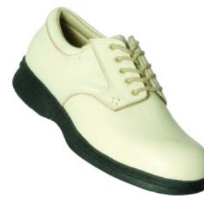
601-03 Taupe Leather Lace Velcro also available in: 410-01 Black Leather Lace Velcro