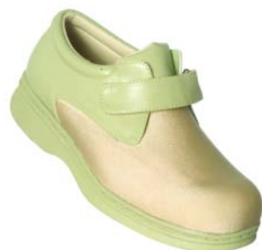
100-03 Taupe Lycra Velcro