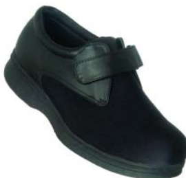
100-01 Black Lycra Velcro