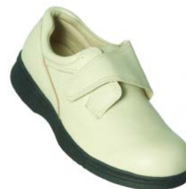
600-03 Taupe Leather Velcro