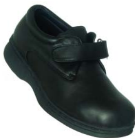
400-01 Black Leather Velcro