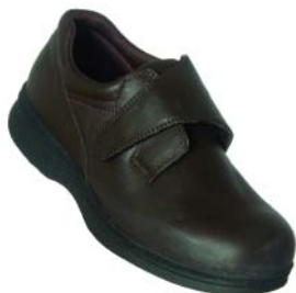
700-02 Brown Leather Velcro

Not all colors are available in all widths Please call for availability