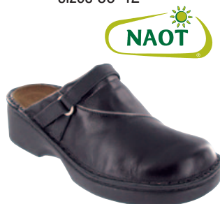
Women's Naot® Tammy