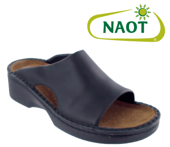
Women's Naot® Rome