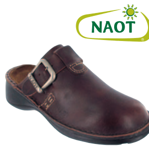
Women's Naot® Viola