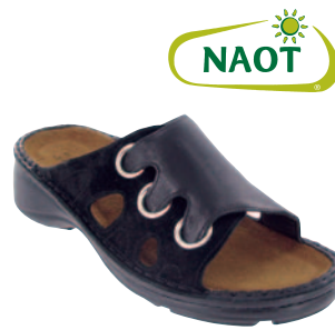
Women's Naot® Hazel