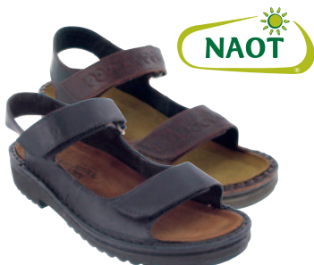
Women's Naot® Kareenna