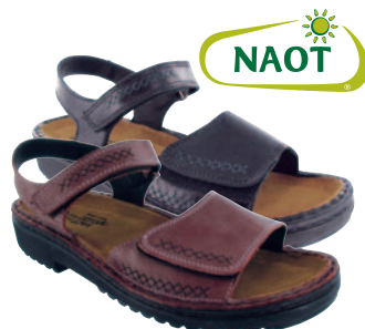
Women's Naot® Marla