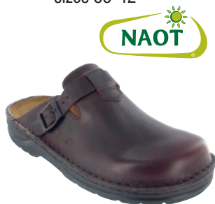
Men's Naot® Fjord